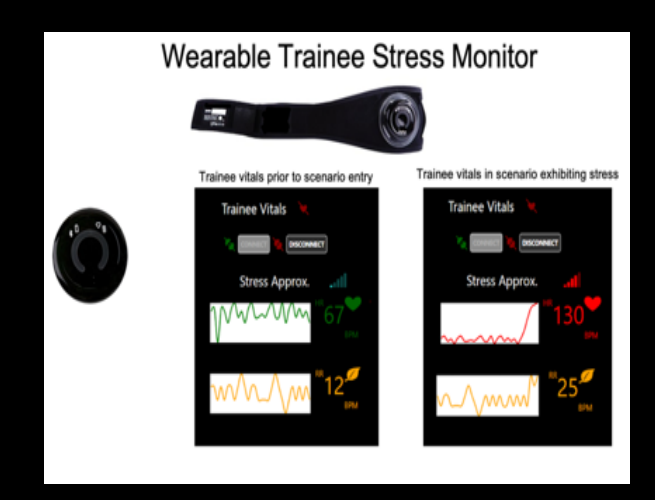
(Mobile Feedback System Instructor tablet screen captures)